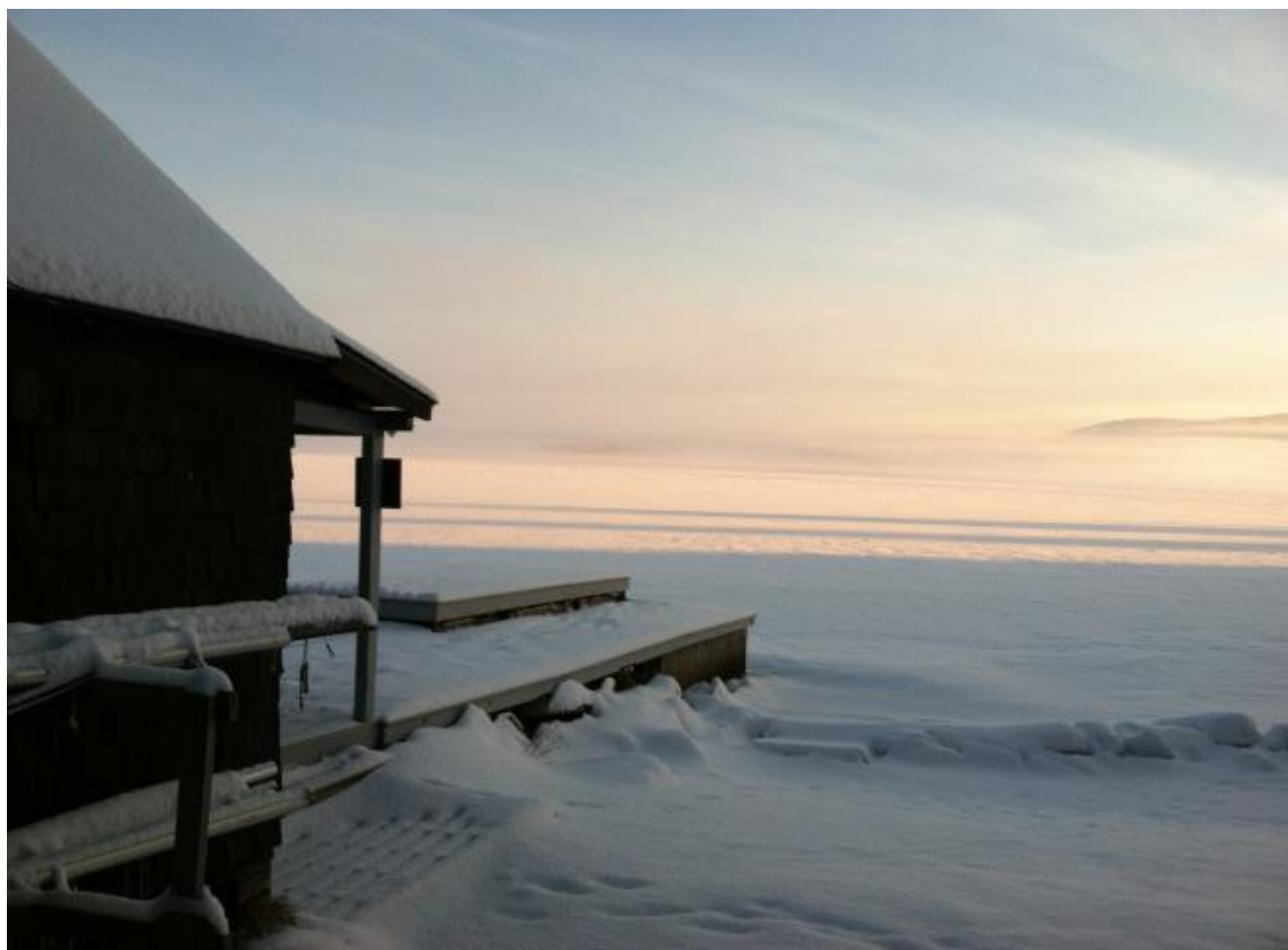
Mid-winter at the Bathhouse