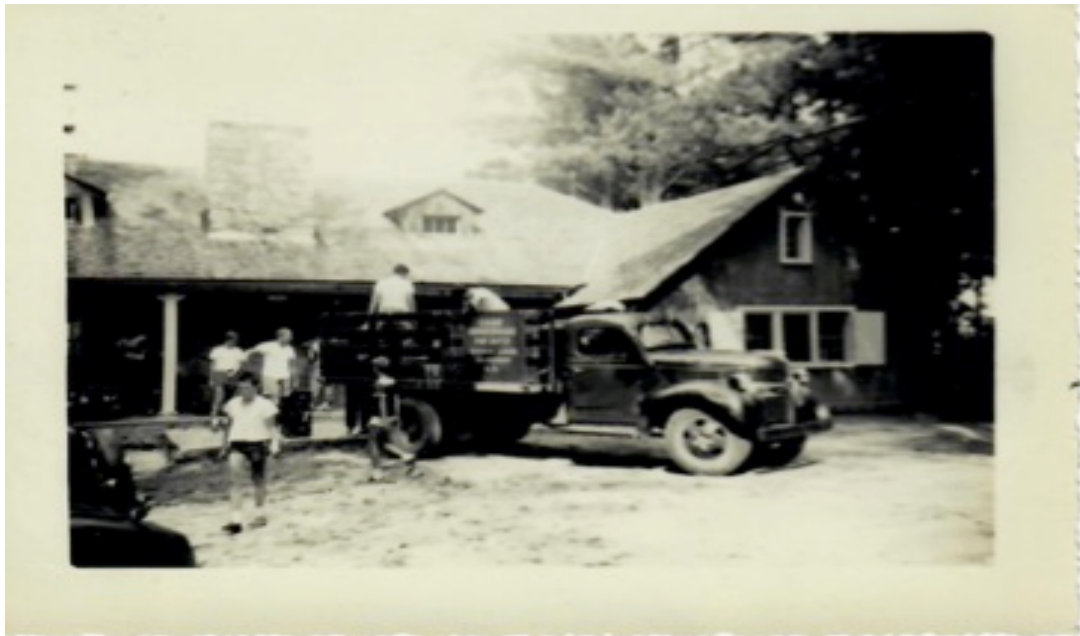
Arrival Day At CAMP 1946

Shop Amazon Smile and list The Deerwood Foundation as your Non-Profit of choice ! The Amazon Smile Foundation will donate 0.5% of your purchase price to the Deerwood Foundation. In the first six months of 2018 we earned over $68. It is easy and doesn't cost you a thing! Thanks-