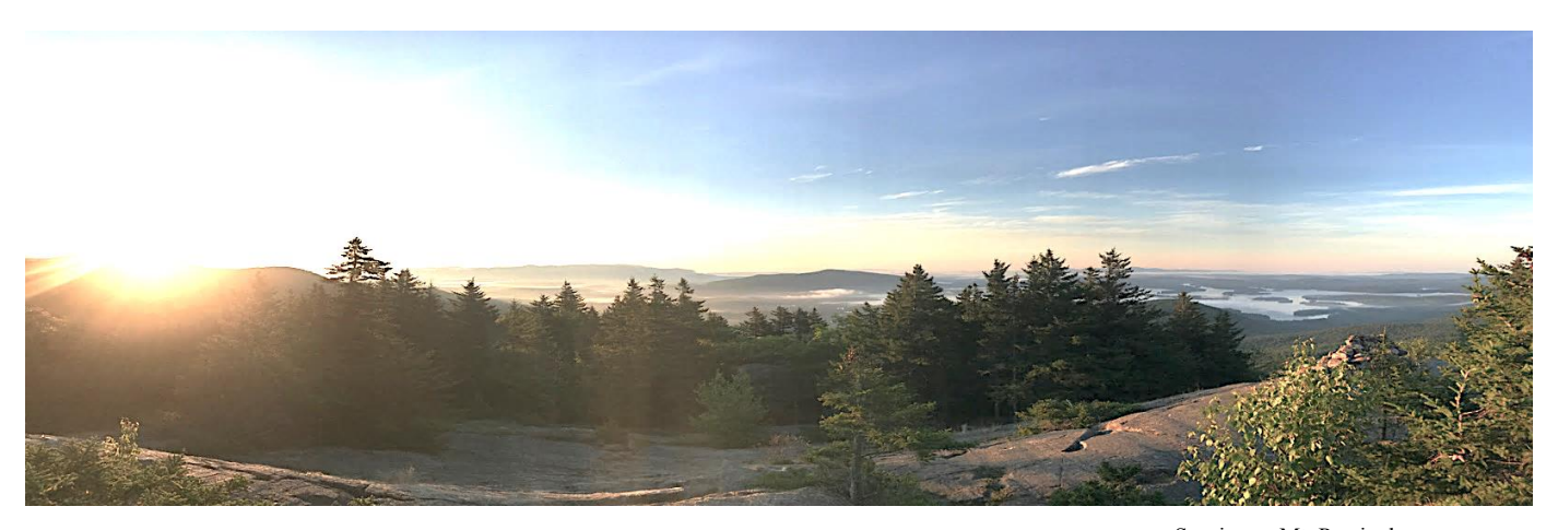
Sunrise on Mt. Percival